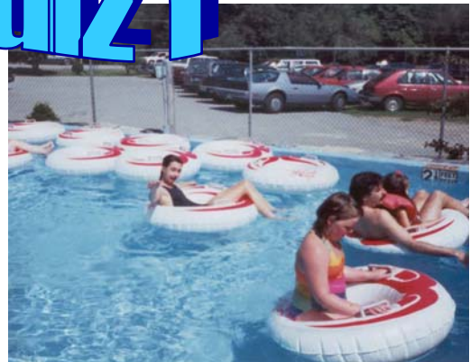
Youth Group Trip - 1993

Quiz 1 -- 10 Questions Write your name and answers against the numbers and mail to the Church or Drop the answers in the Collection Plate